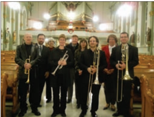
Above: Cathedral Brass and organists gather following the Christmas concert at St-François-d'Assise with the organ in the background (left) and on the steps of the sanctuary (right).

Thanks and congratulations to all participants.